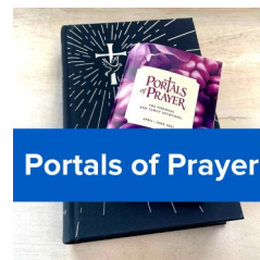
Portals of Prayer