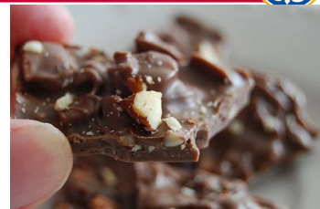
Easy Almond Bark Only 2 Ingredients Needed FrugalFamilyHome.com

Add the almond pieces in and stir well. Spread the chocolate candy onto a waxed paper lined cookie sheet. Let cool at room temperature or you can refrigerate it to speed up the cooling process. Once the candy is set, break up into serving sized pieces.